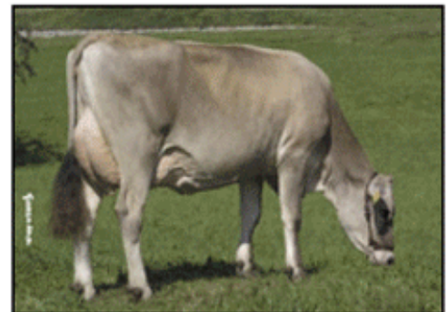
Dtr: Delueg Rombo Rafile