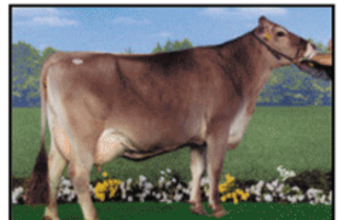
Dtr: Engl Rombo Salbe