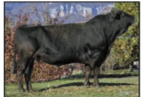
Bull: Superbrown Peter